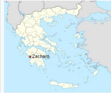
Location within the region